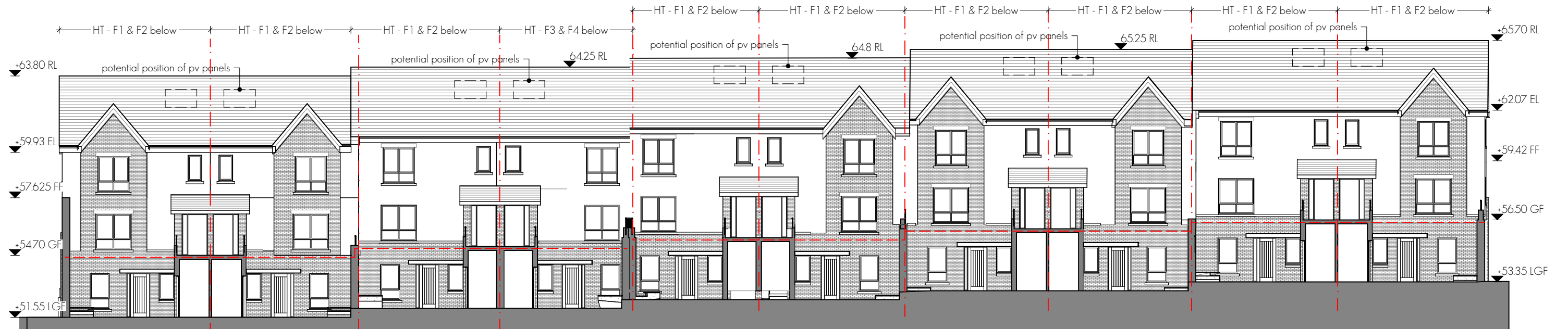
CONTEXTUAL FRONT ELEVATION (SOUTH WEST) - SHOWING LOWER LEVEL